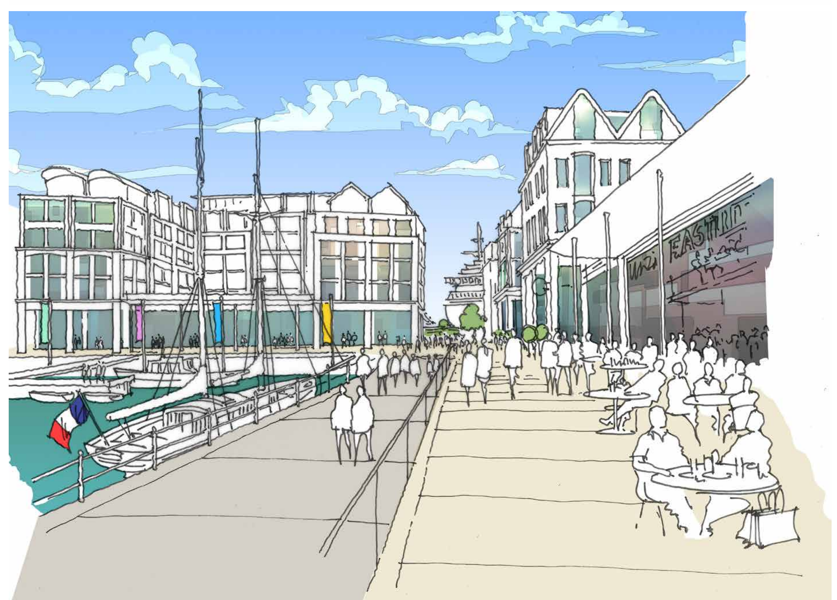
Ideas being explored at Royal Pier