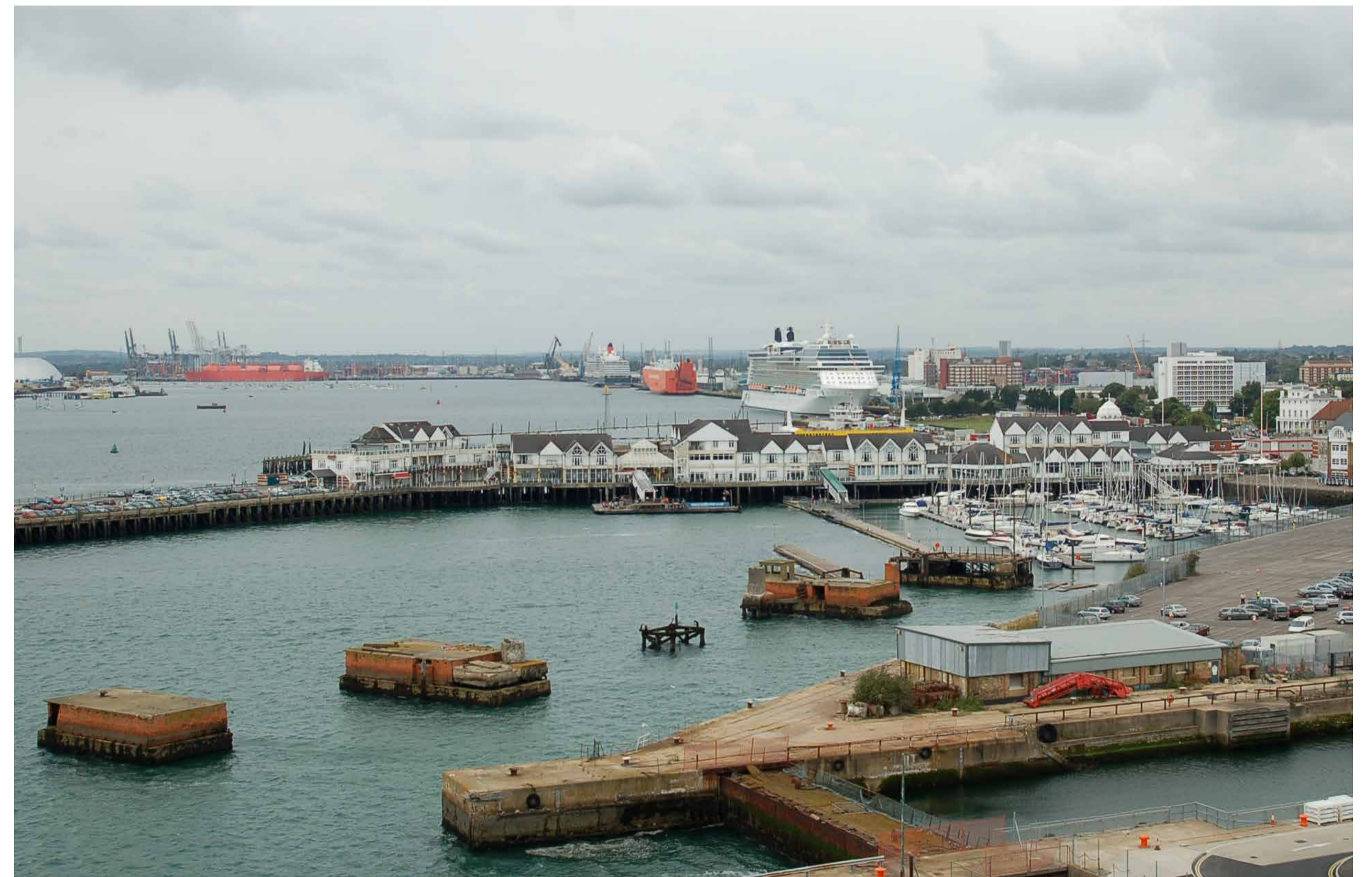
Aerial photo showing Trafalgar Dock and the dolphins