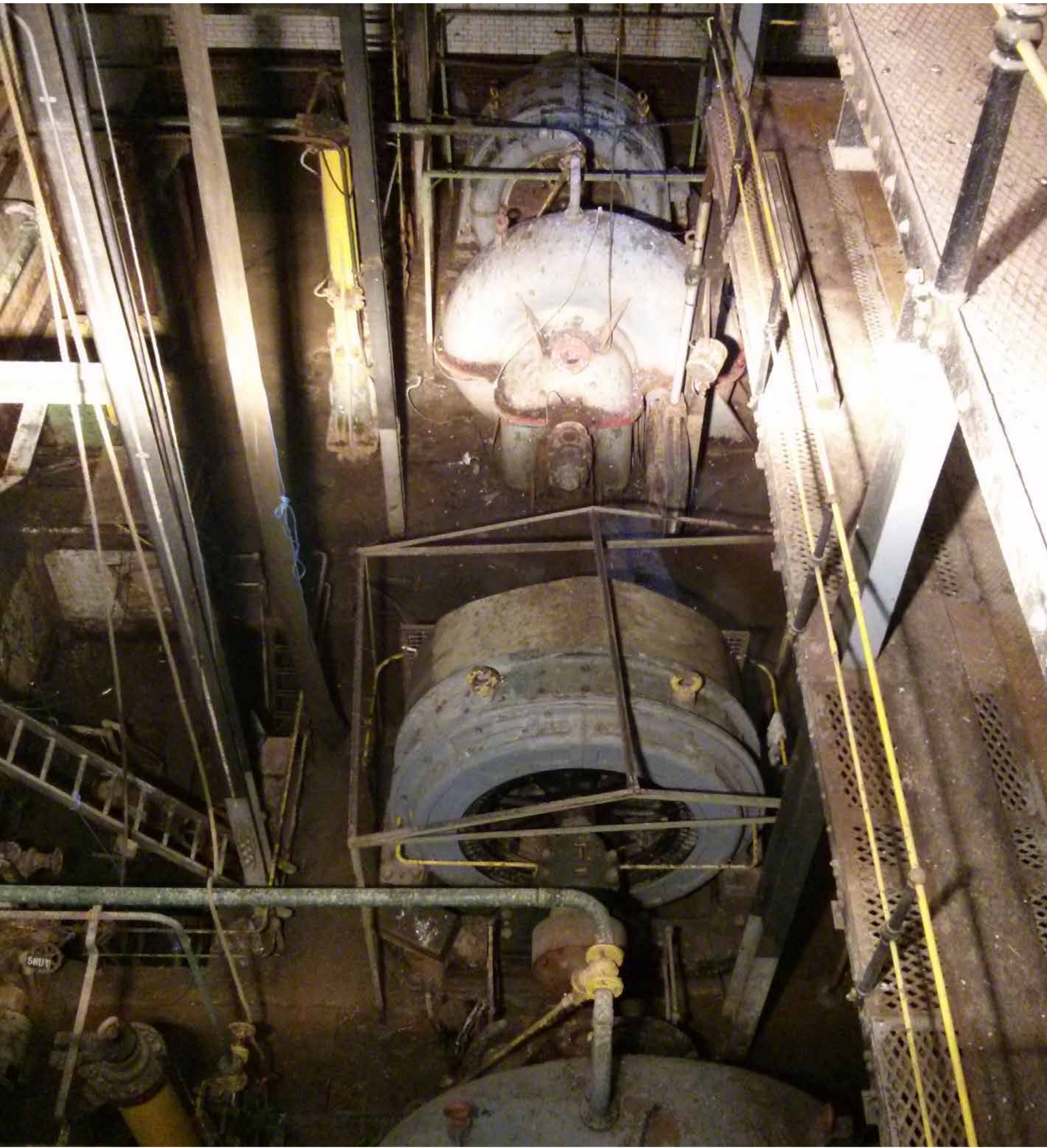
Pump well at Trafalgar Dock

An exciting new waterfront for Southampton