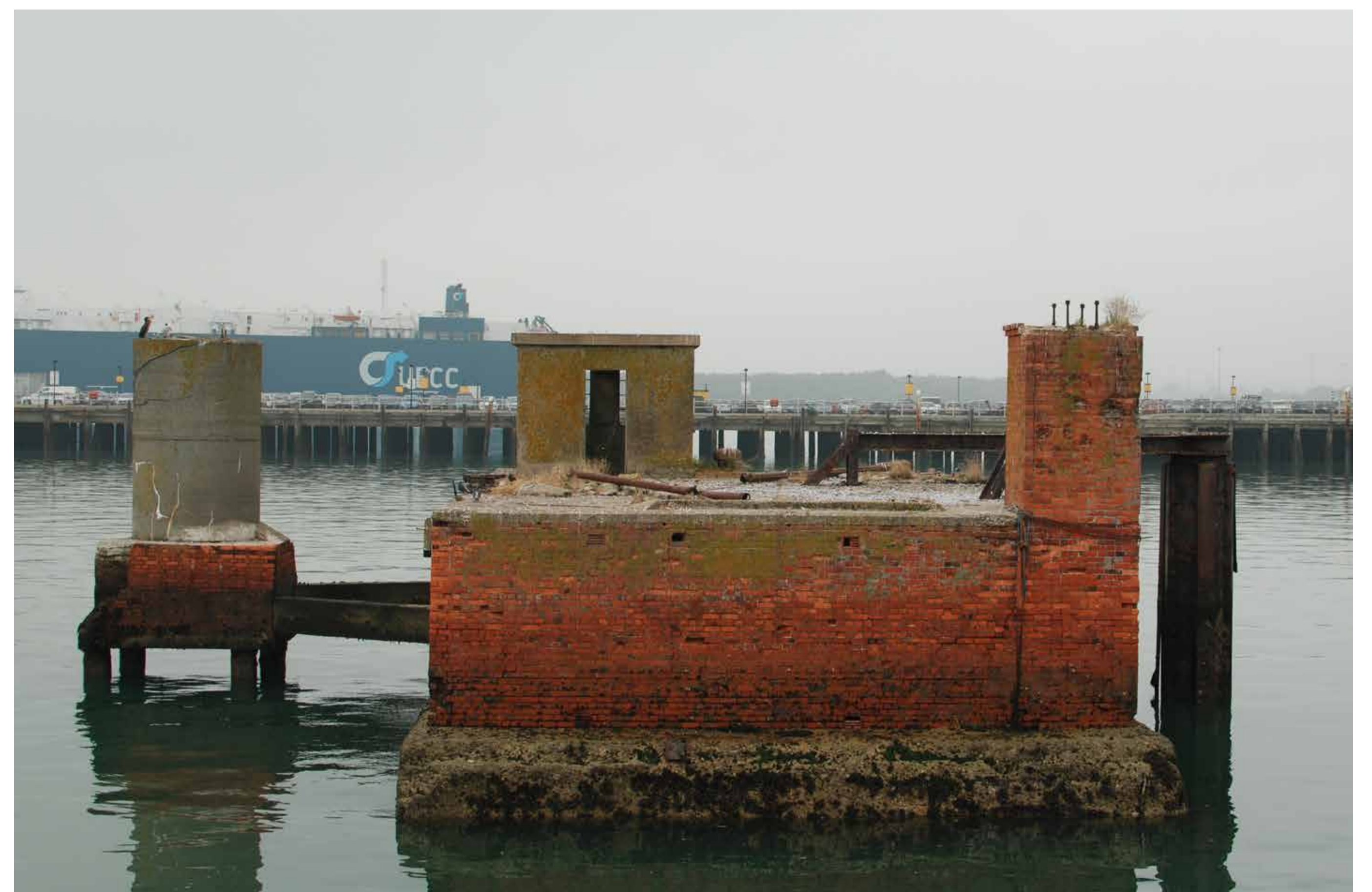
Close up photograph of a dolphin