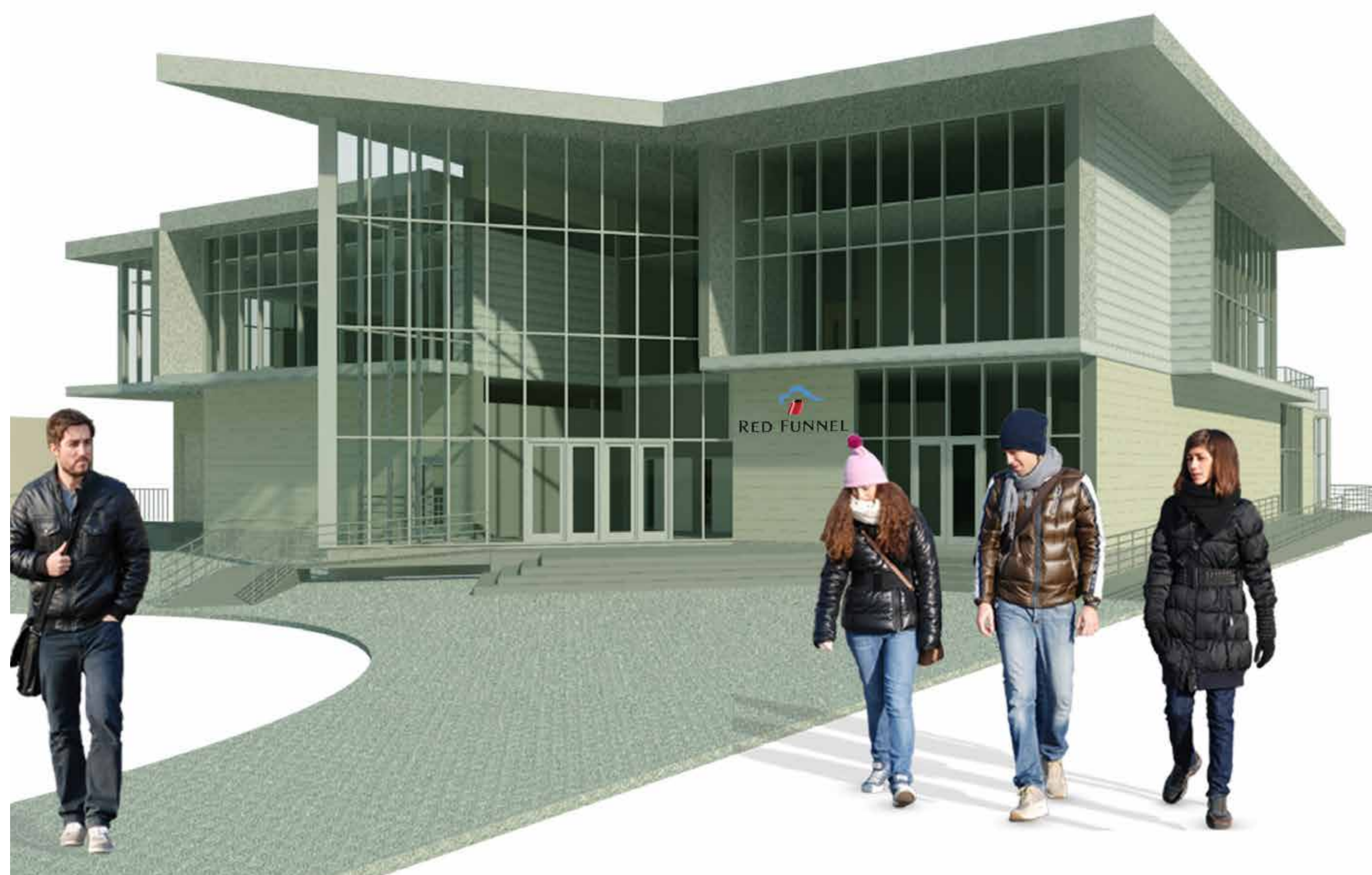
Emerging proposals for the new terminal building

An exciting new waterfront for Southampton