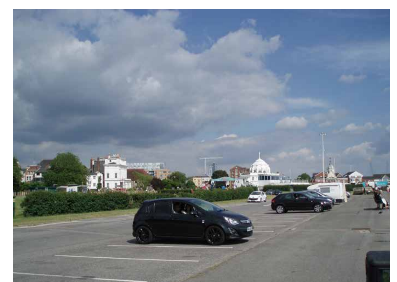
Photos of the existing Mayflower Park and Royal Pier site